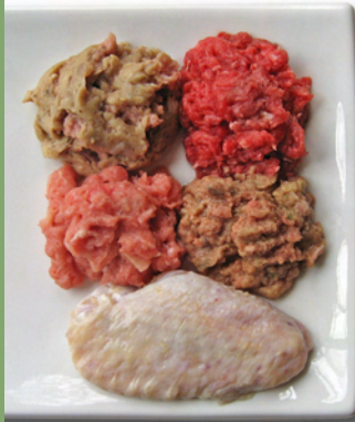
An assortment of ground raw diets and whole bone-in cuts.