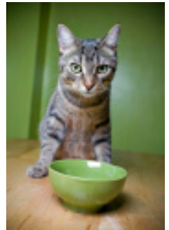
The first step is to stop free-feeding dry food.